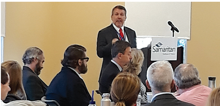
Approximately 75 healthcare professionals and others who serve Veterans attended Samaritan's Moral Injury and Veteran-Centric Care Conference in October.