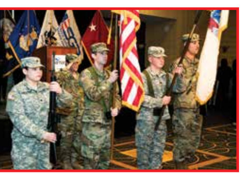
New Jersey Army National Guard 117th Combat Service Support Battalion Color Guard